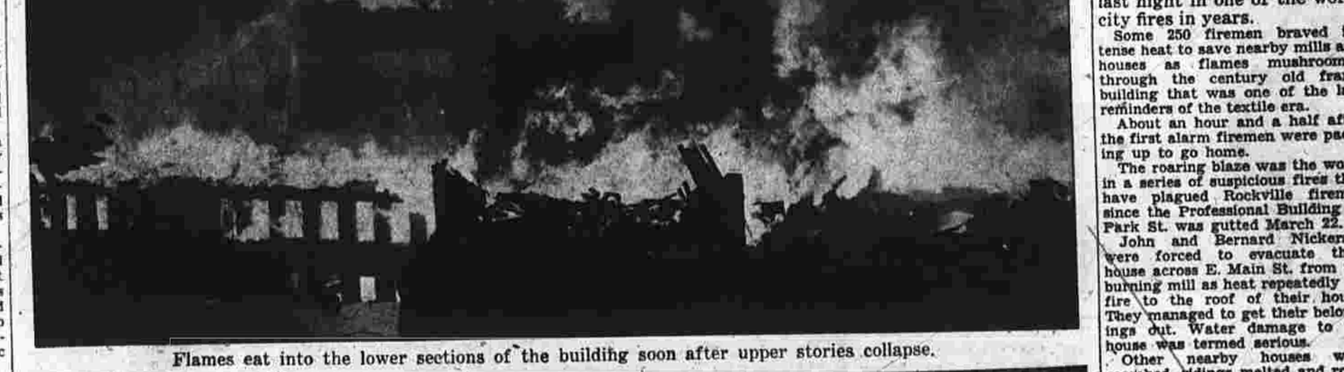
Flames eat into the lower sections of the building soon after upper stories collapse.

The State Fire Marshal's office is today investigating a spectacular blaze that leveled the vacant 6-story American Mill in downtown Rockville last night in one of the worst city fires in years.